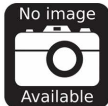
Intern/Trainee - Meritorious Camille Wallace