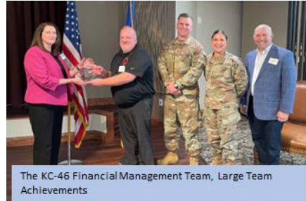
The KC-46 Financial Management Team, Large Team Achievements