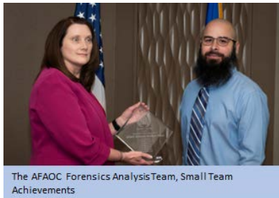
The AFAOC Forensics Analysis Team, Small Team Achievements