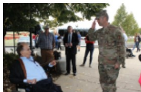
Col Sherman saluting Senator Bob Dole, recipient of two Purple Hearts and the Bronze Star with "V" device for valor